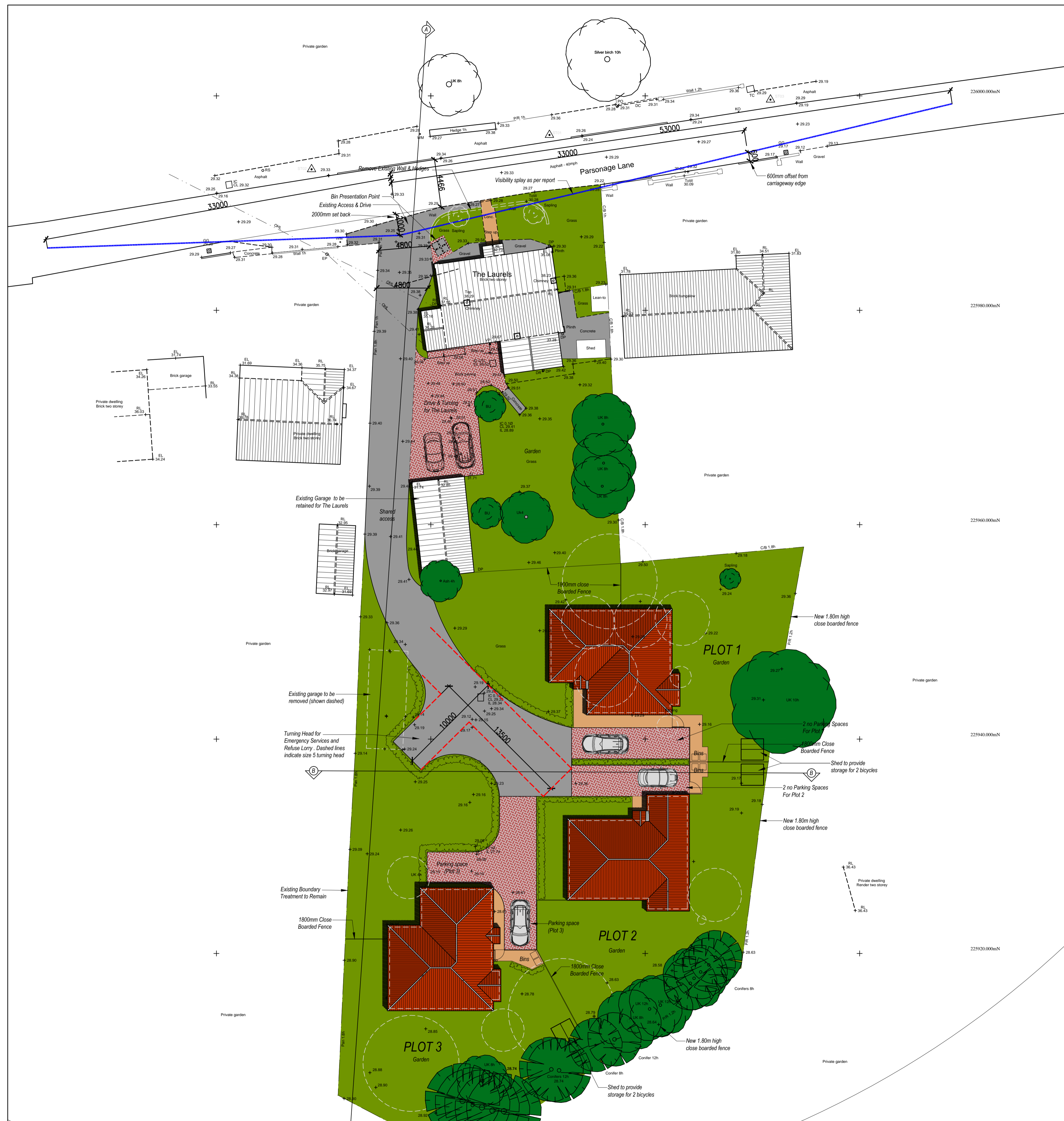
Proposed Access / Part Site Plan Scale: 1:200